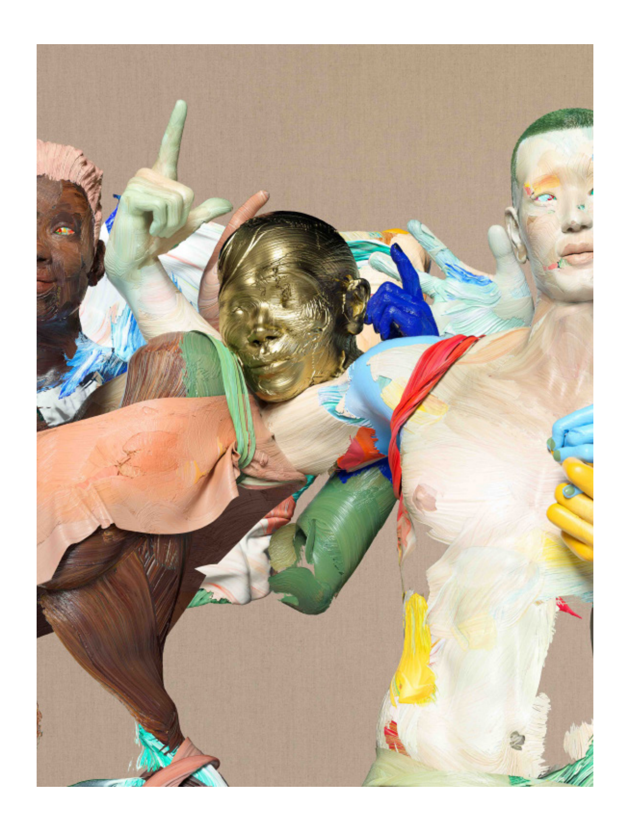
Agency constellation 2024 Digital print on linen 120 x 90 cm