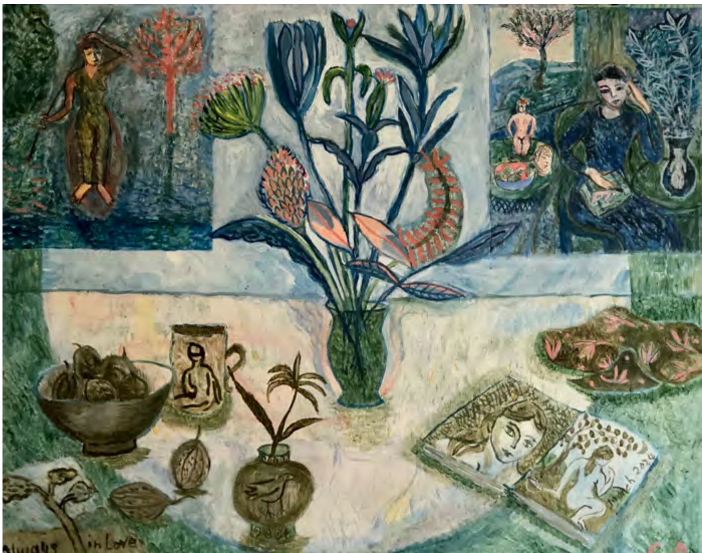
Always in Love 2024 Oil with collage 76 x 60 cm