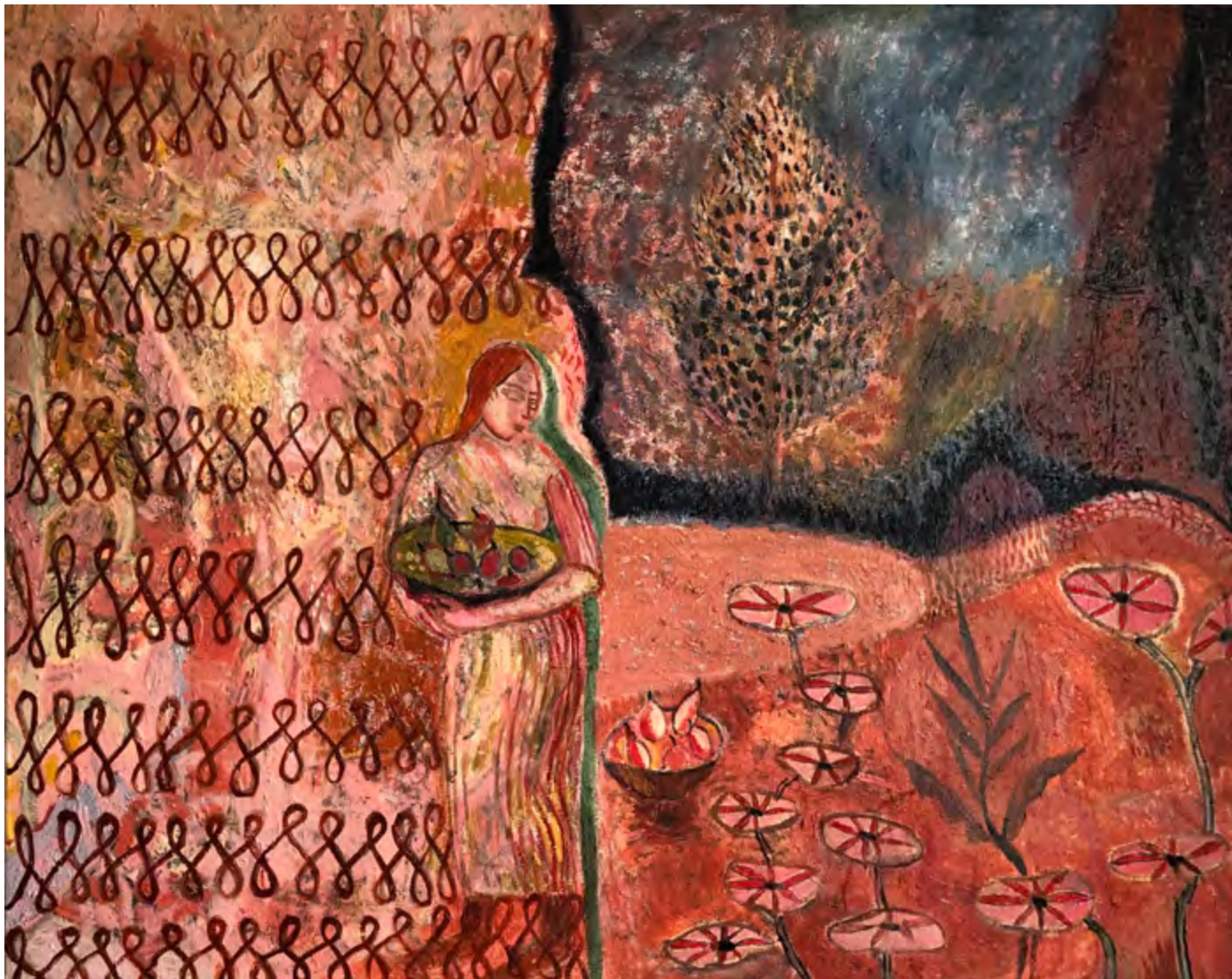
This is Love 2024 Oil on linen 76 x 60 cm