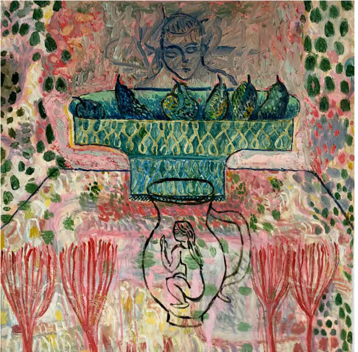
Mother 2024 Oil on linen 60 x 60 cm