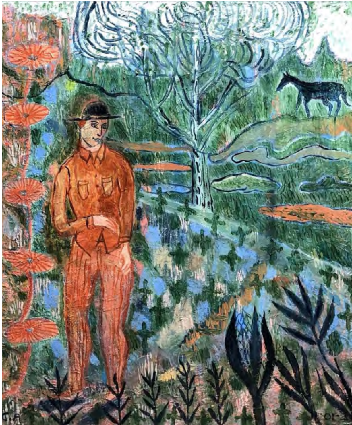
Beautiful Brothe 2024 Oil on linen 50 x 60 cm