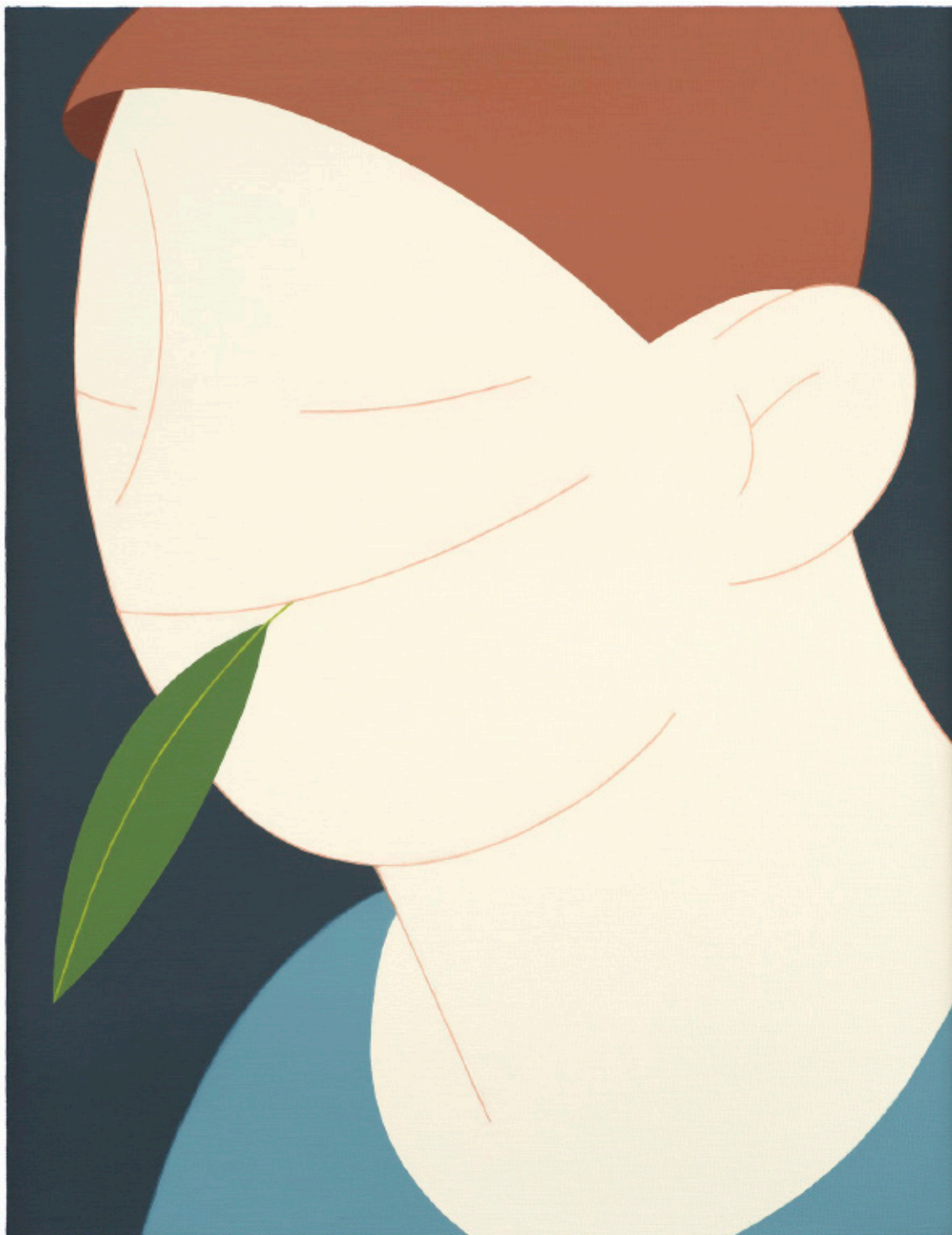
Someone 2024 Oil on canvas 53 x 41 cm