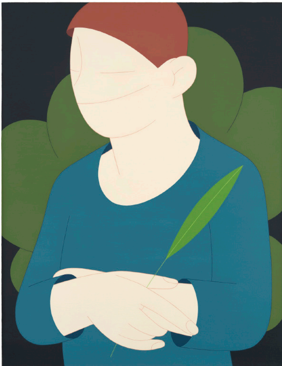
Someone 2024 Oil on canvas 117 x 91 cm