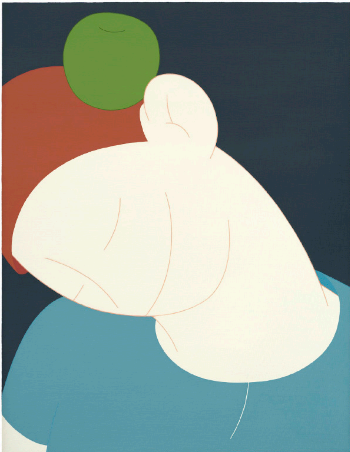
Someone 2024 Oil on canvas 77 x 60 cm